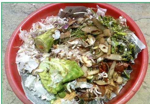
Fig. A: Typical Wet Garbage of Indian Urbanite