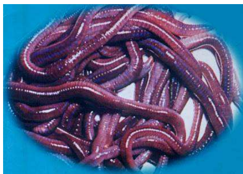
Fig. C: Compost Earthworm Eudrilus eugeniae