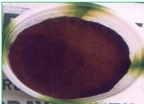
Fig. D: Vermicompost - The Final Product