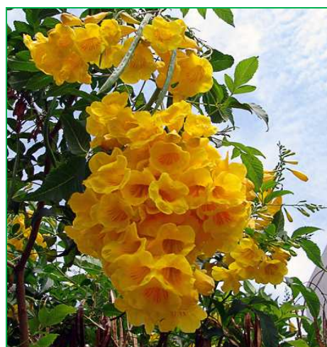
Fig1: Flowers of Tecoma stans

Flowers of plant were soaked in distilled water and heated in a beaker kept over a water bath for 2 hours to facilitate quick extraction. Then it was filtered and the filtrate was collected in a separate beaker. The filtrate was concentrated upto high viscous state. This extract is used for dyeing cotton.