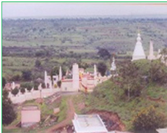
Fig. 7: Khandoba temple at Pimpalgoan-Rotha

It is spiritual place of God Khandoba. The temple is present at the top of hilly regions of Pimpalgoan-rotha village. Natural and attractive waterfalls are frequent feature of this area during monsoon period. Greenery and beauty attract tourists towards the village every year. Government has developed this site as a tourist and religious centre. In the year 2008, a film was also produced regarding God 'Khandoba' in Pimpalgoan-rotha village. Yearly festival 'Yatra' is celebrated in the month of March where five to six lakh devotees visit to this place. Among the visitors other state devotees also contribute a large number. It is also very significant place as a tourist place in Tahasil.