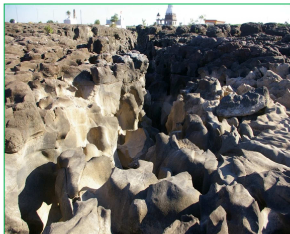
Fig. 8: Pot holes in Kukadi river channel at Nighoj