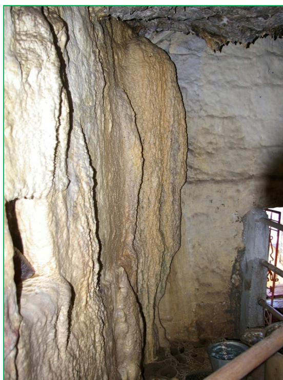
Fig. 3: Stalagmite observed in the caves of Padli-Darya