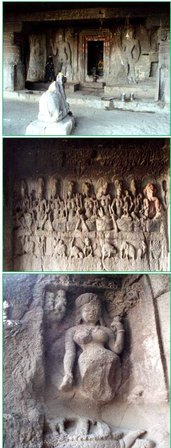
Fig. 6: Historical carvings observed at Dhokeshwar temple

present study also noted the weathering and erosion in these cave and therefore, need to protect these caves. The point can be developed as tourism centre.