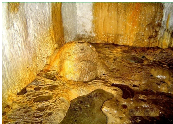
Fig. 2: Stalactites observed in the caves of Padli-Darya