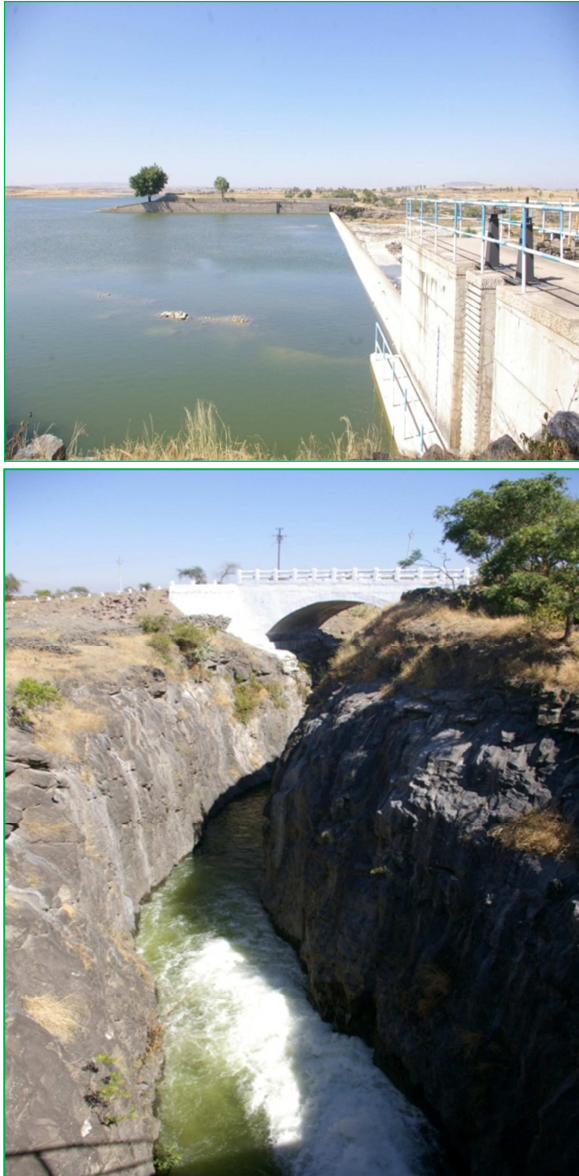
Fig. 5: Mandohal dam and water channel from the dam