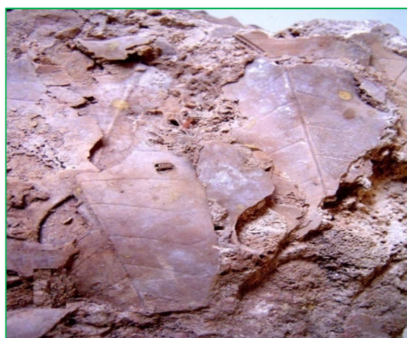
Fig. 4: Plant fossils observed after major landslide in the caves of Padli-Darya