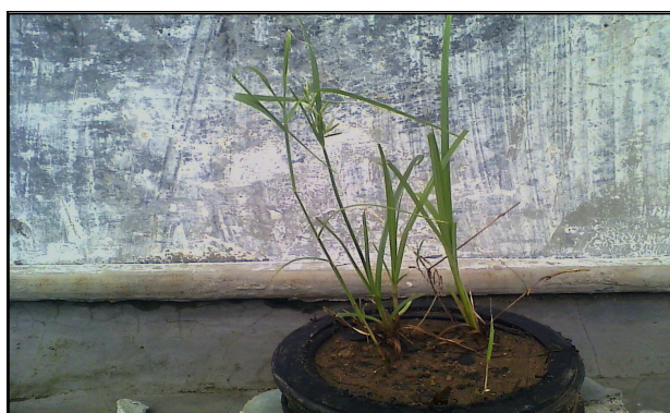
Fig-1 Plantation of Cyperus Rotundus Linn.