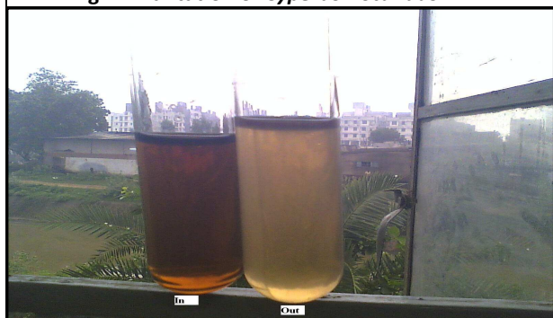
Fig-3 Comparison of Inlet and Outlet Water minimum dilutions (10:90 %)